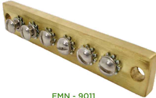
EMN - 9011

The EAC-9011 is a bar where all the devices that need to be grounded in the work station get canalized to.